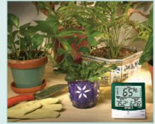
Checks the Humidity and Temperature levels for optimal plant growth in greenhouses.