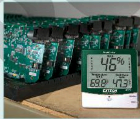
Indicates Humidity and Temperature levels in Production areas.