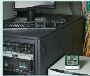
Alerts low Humidity levels in Computer rooms to help prevent electrostatic conditions.